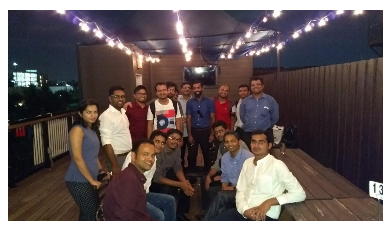
SPGNA Social at King's Court